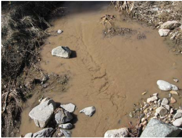
Creek at Thumb Butte Park

Turbulence can take place on a very small or a very large scale. What we see on the surface can appear very complex, but there have to be analogous forces at work.